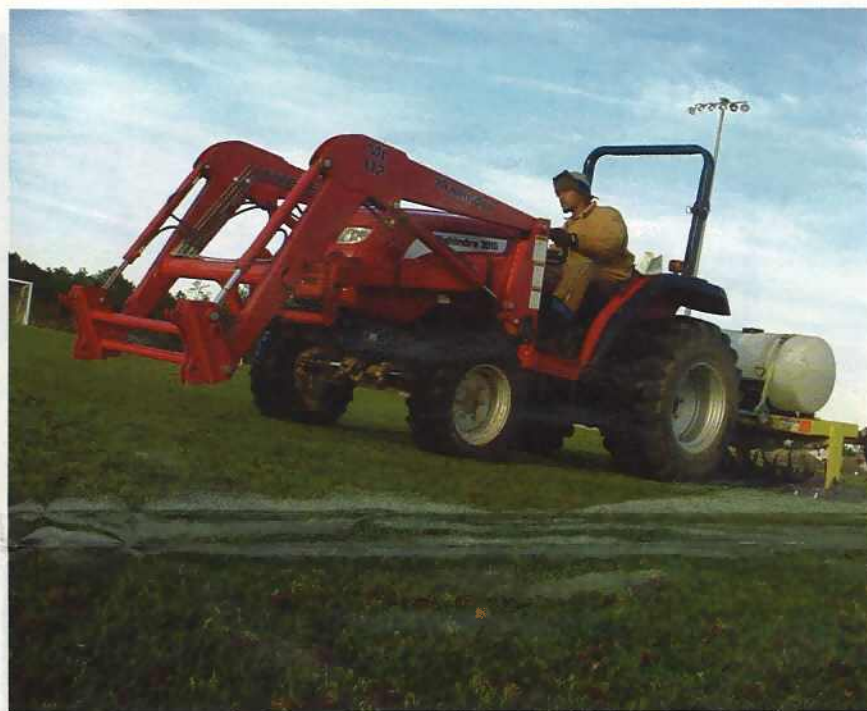
August vacuums plugs of Bermudagrass during the aeration.

Now, four years after completion, the Gulfport Sportsplex hosts several local, state, regional and national baseball, T-ball, softball, soccer and flag football tournaments.